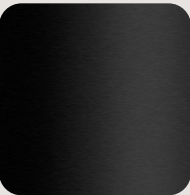
BLKE Black Textured