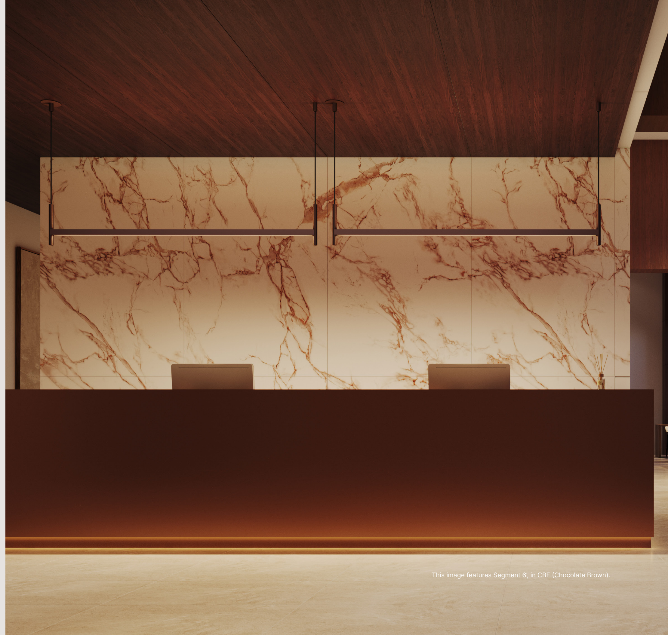
This image features Segment 6', in CBE (Chocolate Brown).

Add a defining touch with Segment, a minimalist linear luminaire available in 3 sizes and 16 colors.