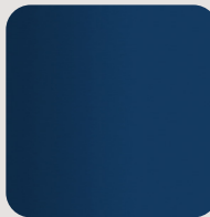
NBE Navy Blue Textured