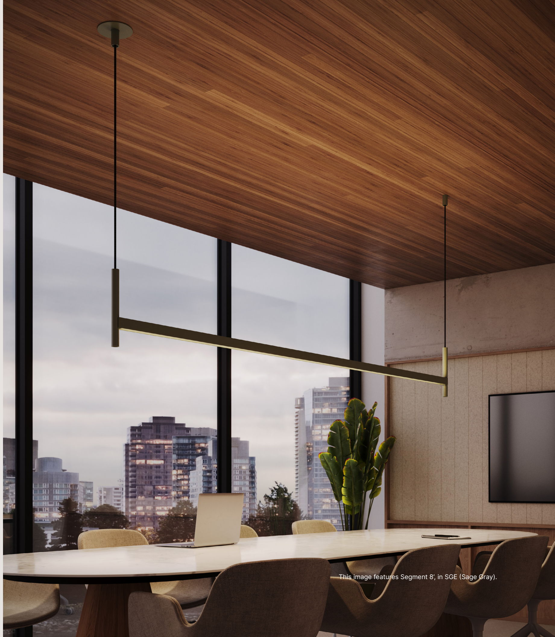
This image features Segment 8', in SGE (Sage Gray).