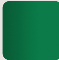
GGE Grass Green Textured