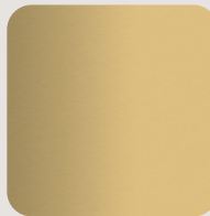
SBE Sand Beige Textured