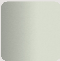
LNE Lunar Gray Textured