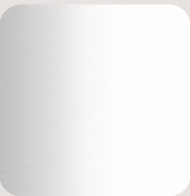
WHE White Textured