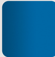
DBE Dynamic Blue Textured