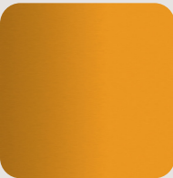
AYE Apricot Yellow Textured