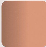
CPE Clay Pink Textured